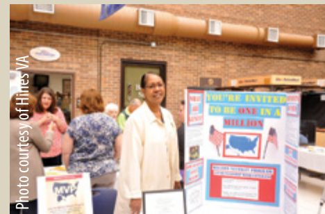
Staff at the Edward Hines, Jr. VA Hospital in Illinois recruited Veterans for MVP during VA National Research Week this past spring.

To mark this milestone, local sites across the country organized events that not only recognized the work they had done, but also honored our MVP Veterans, who have so generously donated their time, history, and blood toward a brighter future for all. ●